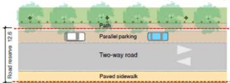
Option 3: two-way road / parallel parking

Option 1 will reduce speeding (narrow road), allow for more (diagonal) parking and is the less costly of all the options